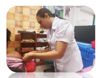
Flu vaccines at NAMA